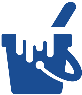
Mix the material